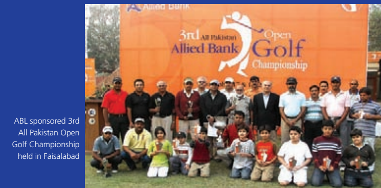
ABL sponsored 3rd All Pakistan Open Golf Championship held in Faisalabad