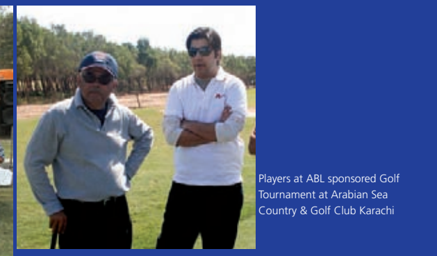
Players at ABL sponsored Golf Tournament at Arabian Sea Country & Golf Club Karachi