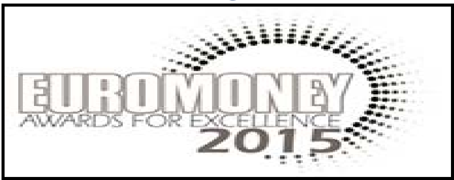
Best Investment Bank 2015