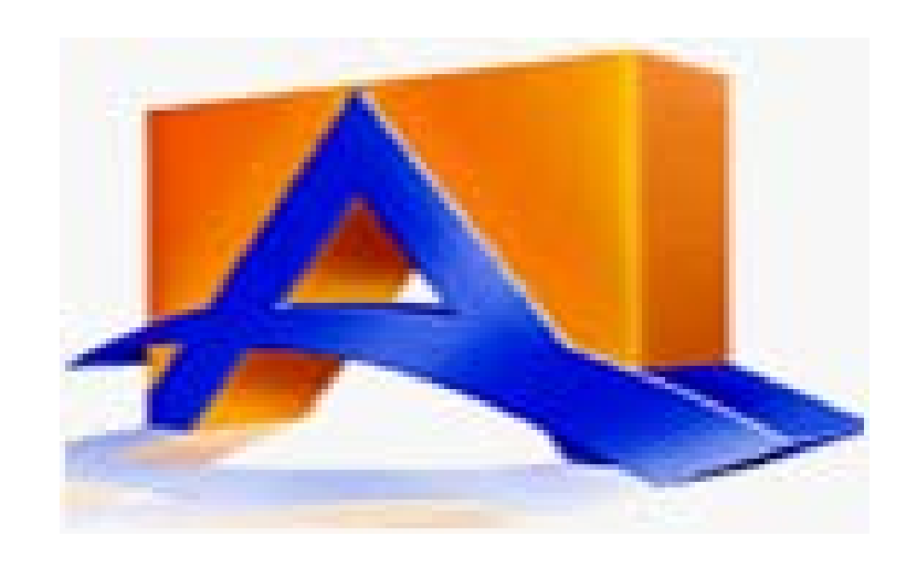
Investor Presentation For The Half Year Ended June 30, 2015